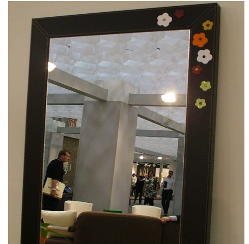
Back to life!